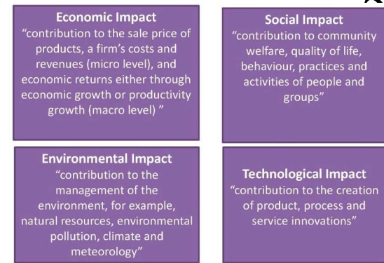
Figure 2. Types of e-commerce-related last-mile logistics impact on cities.

The impacts that e-commerce-related last-mile logistics systems can have on cities were classified as economic, social, environmental, and technological (Figure 2). This classification system is based on sustainability theory's TBL [17] a fourth—technological—impact, defined as the contribution to or impact on the creation of product, process, and service innovations [18]. Hence these selected papers were classified into the four categories shown in Figure 2, as discussed in Section 4.